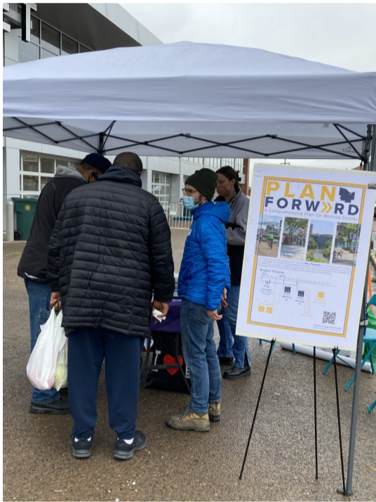
(Pop up event at Rochester Public Market)

To learn more, visit: Plan Forward Website